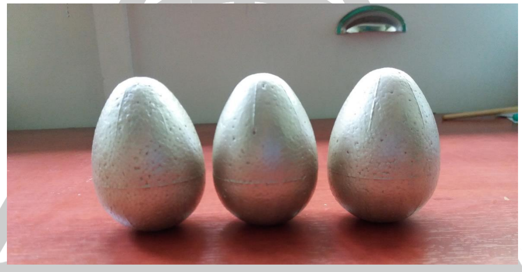
And now your Occamy eggs are done!