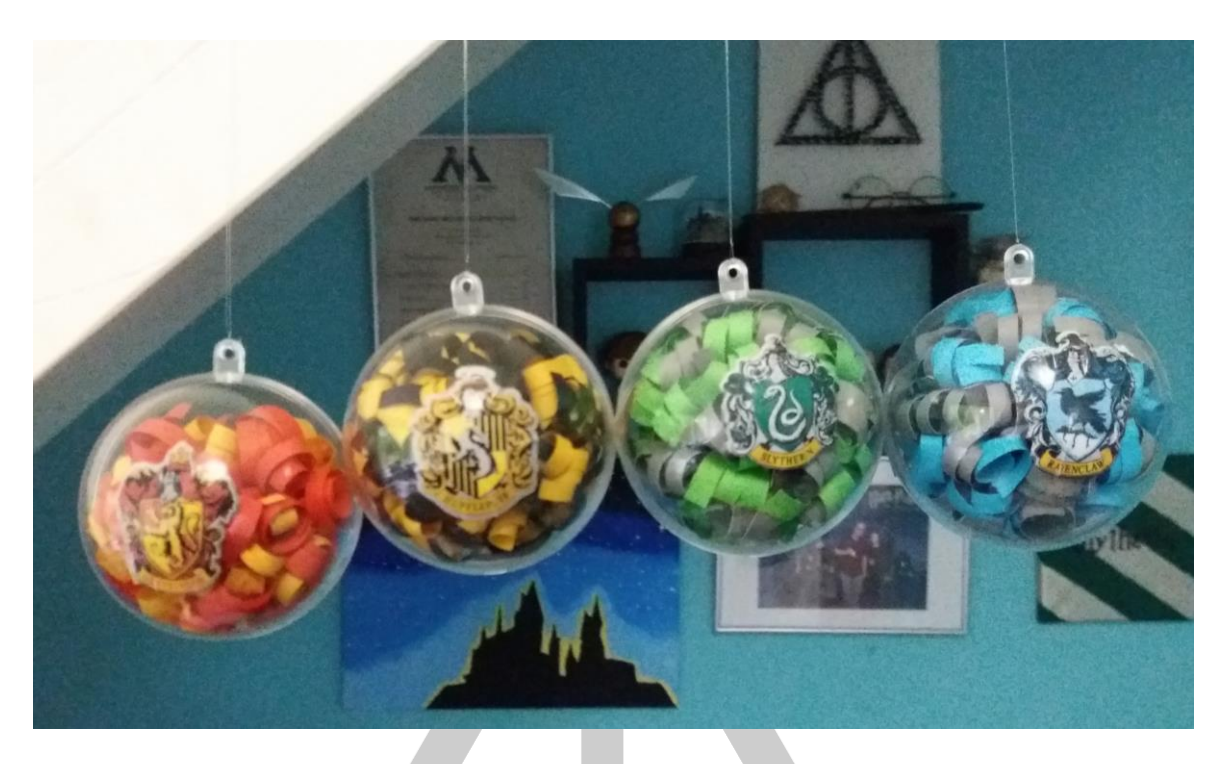
And now your house themed ornaments are done! Have fun making these ornaments!!