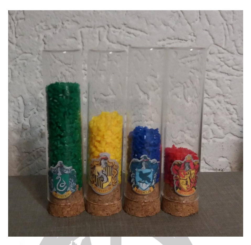
And now your House points are done! Have fun making these House points!!