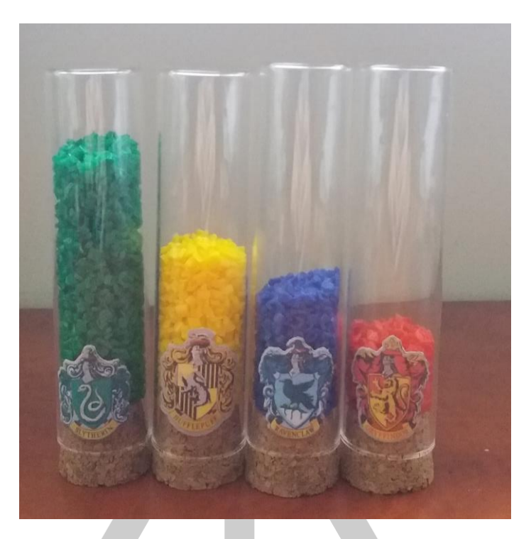
Fill up the glass vials with the beads. Fill each vial up with different amount of beads.