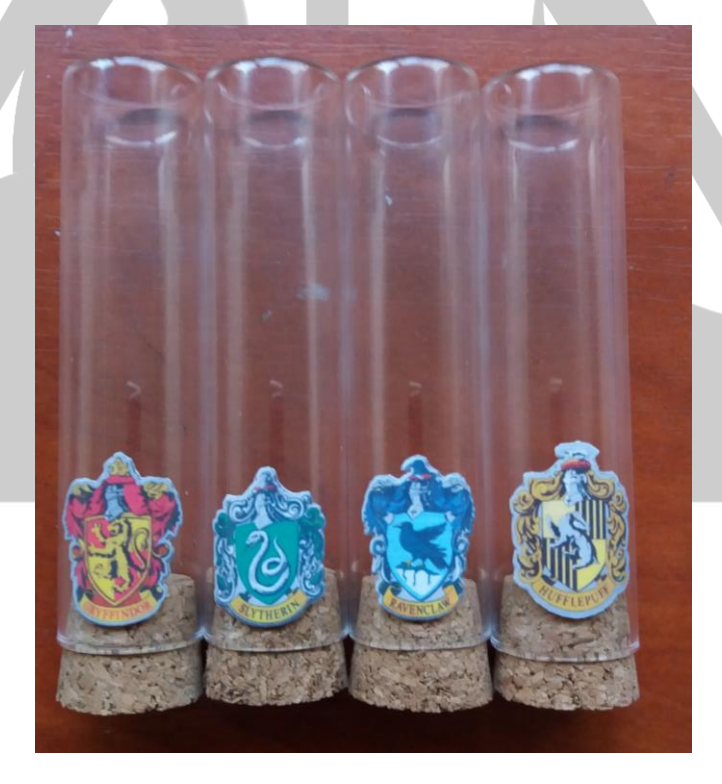
Carefully cut out all the crest and stick them onto the glass vials.

Cover the back of the crests with double sided tape.