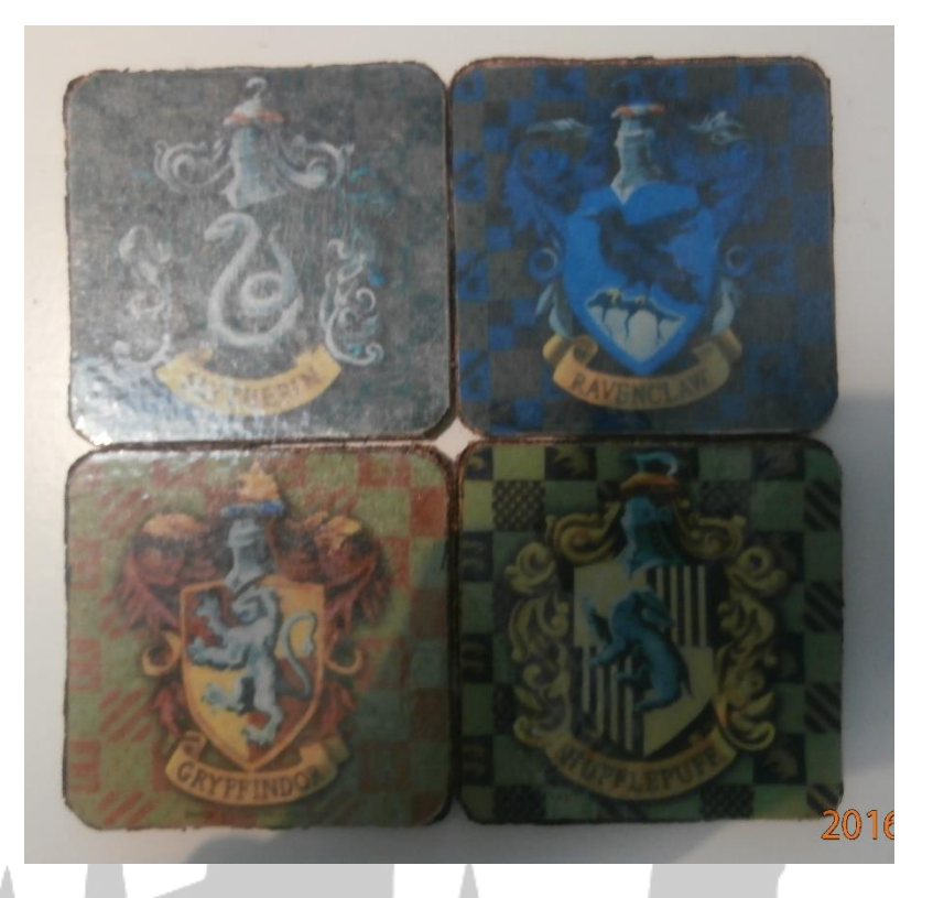
Now all your coasters are done! You can find the pictures that I used on the blog Have fun making these coasters!

Let them dry for about 1 hour. If you didn't add the clear tape on it you can apply a few thin coast of mod poge on the pictures. Let them dry between the coats of glue.