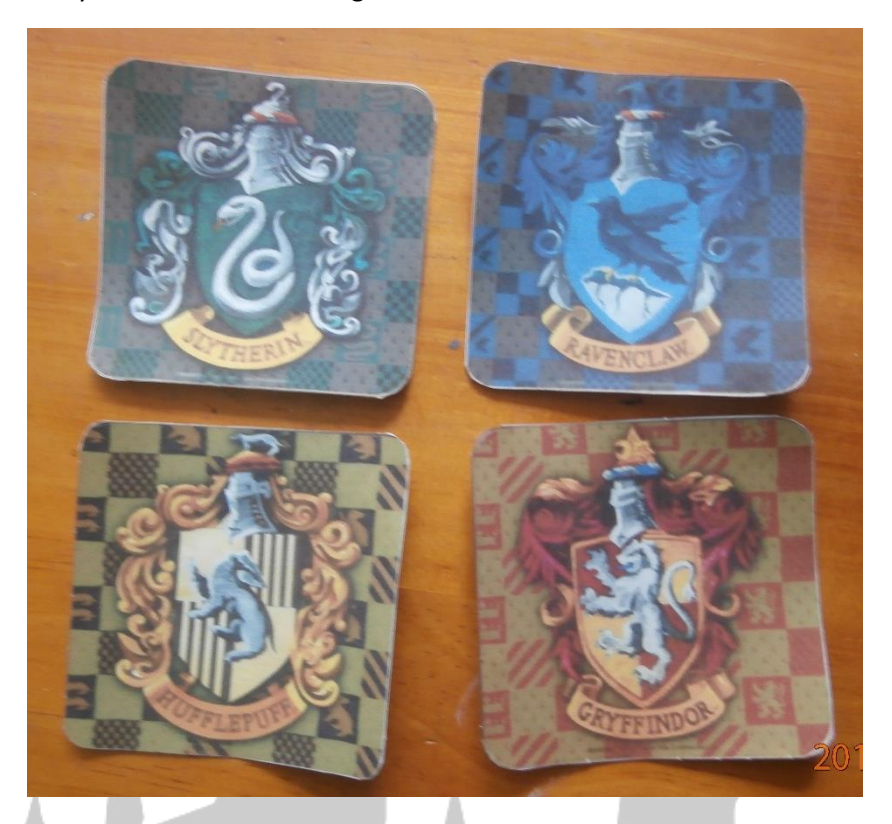
Take your pictures and trace them on the cork.

So first you want to cut out your pictures. You can use whatever picture you want for this. The pictures that I used you can find on the blog.