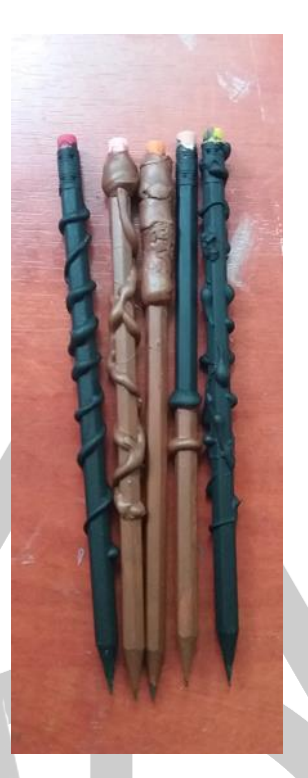
And now your wand pencils are done! It's a really easy and quick DIY and perfect to do if you're bored. Have fun making these pencils!

If you want to add some extra detail to the pencils use some gold or silver paint and a dry brush and brush it gently on the already brown of black painted pencil.