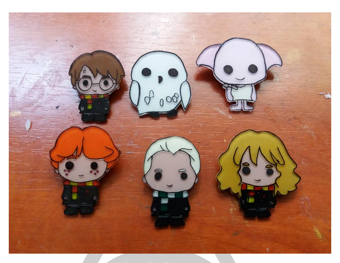
And now your character pins are done! Have fun making these pins!