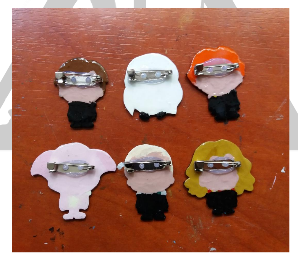
When the sealer is dry grab your hot glue gun and add the pin backs to the figures.