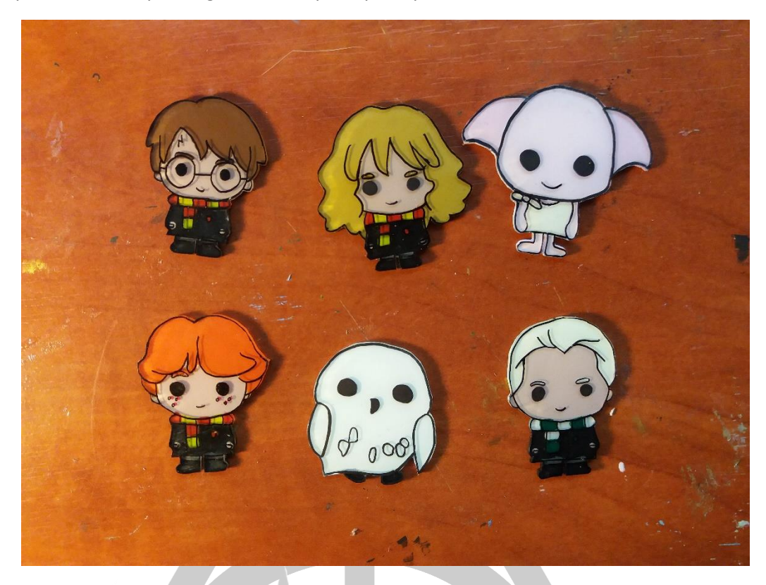
To secure the paint so it won't scrape of that easily add a layer of some sort of sealer I used mod podge.

When your done with painting let them dry completely.