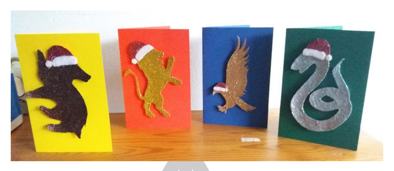
And now your Christmas cards are done! Have fun making these christmas cards!!