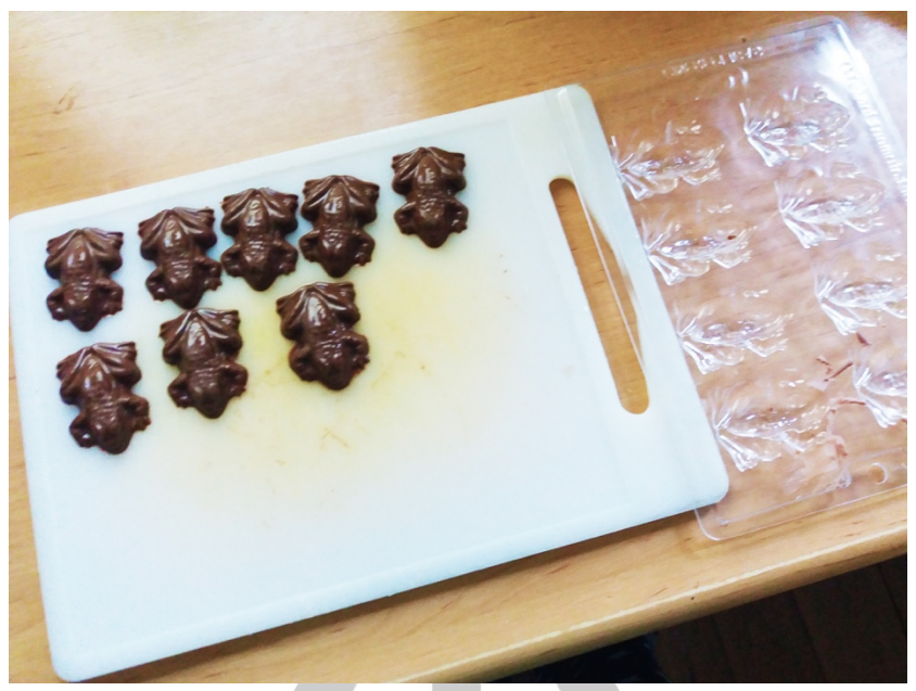
when your frogs are set carefully take them out of the mold and place them into the boxes.