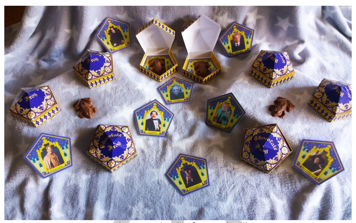
and now your chocolate frogs are done!! I hope you have fun making these!!