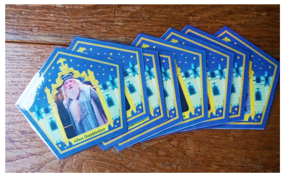
Cut all of the cards out again and your homemade chocolate frog cards are done!!!