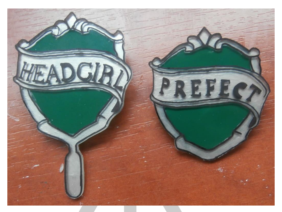
And now your badges are done! You can find the templates that I made on my blog. Have fun making these pins!

(TIP: to secure the paint on the badges you can add a layer of mod podge or any kind of topcoat/sealer before you add the brooch pin)