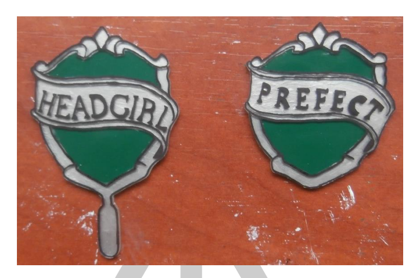
After the paint is dry add an brooch pin with your hot glue gun.

After they've cooled down paint them in the house you're in or the house you like. Start with the silver/gold and then paint the color of the house. Add as much layers of paint until your satisfied with the look of it.